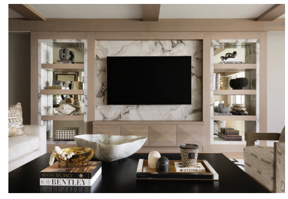
ABOVE: THE RESIDENCE'S GREAT ROOM SHOWCASES A FEATURE WALL TRIMMED WITH CERUSED WHITE OAK, MIRRORS, AND REAL MARBLE.

BY MARY THURMAN YUHAS