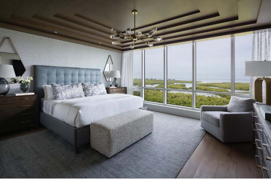
FROM FAR LEFT: THE POWDER ROOM; THE PRIMARY BEDROOM EXUDES A CALM, MODERN ZEN-LIKE FEEL WITH ITS STEPPED CEILING AND BLUE-HUED COLOR PALETTE

delier hovers over a rectangular wood table surrounded by six klismos-style chairs. "When you have a view to die for, you don't want anything to obstruct it; rather, you want your eyes to float over to the view," states Berry.