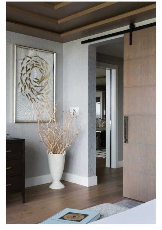
INTERIOR DE-SIGNER WENDY BERRY OF W DESIGN CREATED A VIBE OF COM-FORTABLE EL-EGANCE FOR THE 4,000-SQUARE-FOOT SPACE. KEY DECOR ELEMENTS WERE SELECTED TO COMPLEMENT THE RESIDENCE'S NATURAL GRANDEUR AND UNPARALLELED GULF OF MEXICO VIEWS.