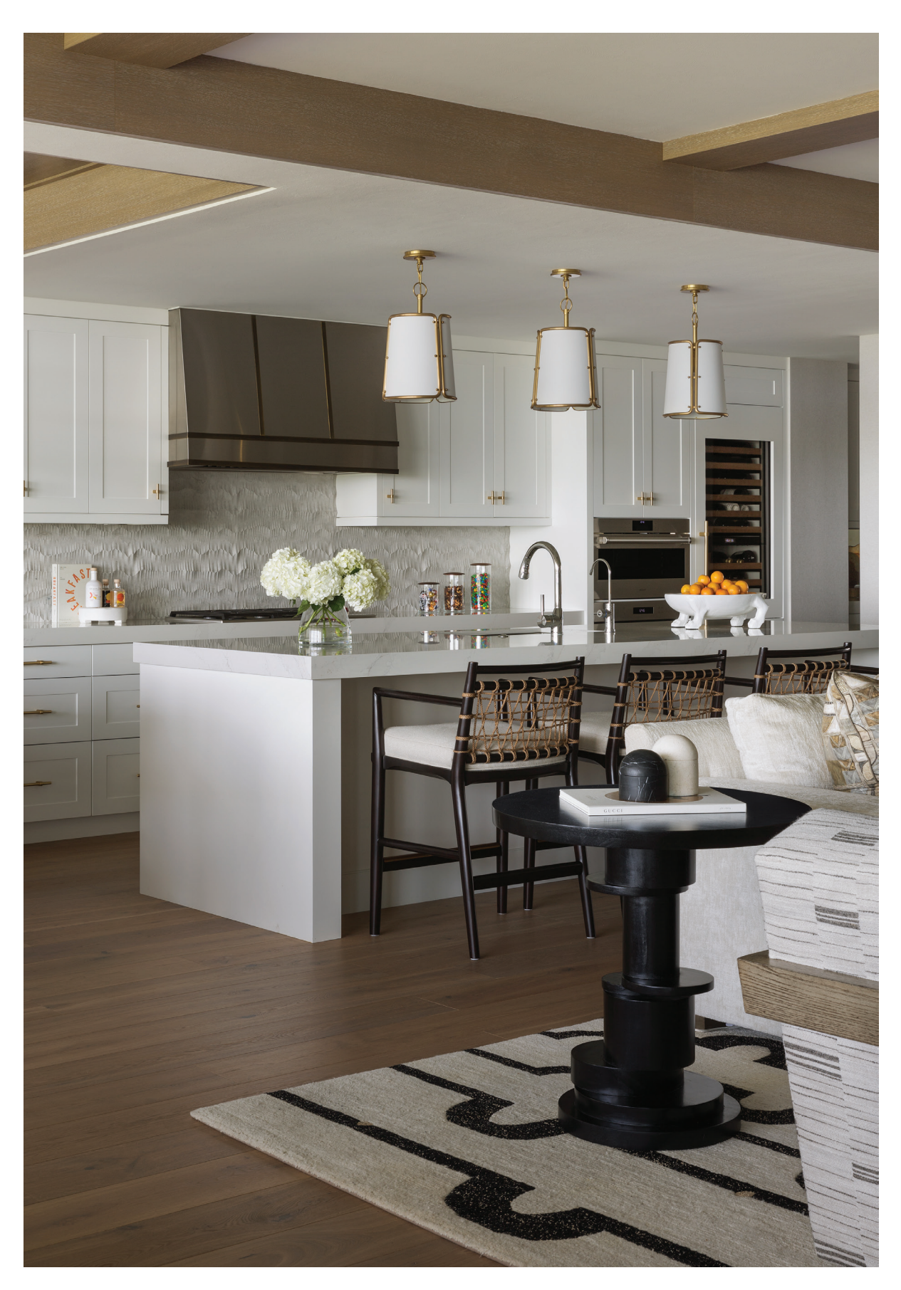
THE NEW CONDOMINIUM'S CHEF-WORTHY KITCHEN (LEFT) BOASTS VIKING AND SUB-ZERO APPLIANCES, A LARGE ISLAND, AND A LIME-STONE TILE BACKSPLASH.