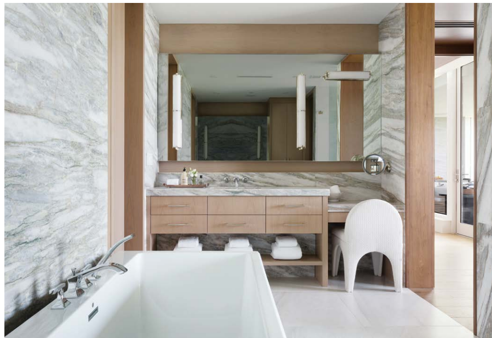
BELOW: The primary bathroom was designed to capture a luxury resort feel with open towel storage and an indulgent soaking tub. Entirely clad in a Mia Field Series marble from Ann Sacks, the space embodies a sense of movement with the stone's wavy veining.

designer, "and it gave us a more subtle distinction between the dark and light woods."