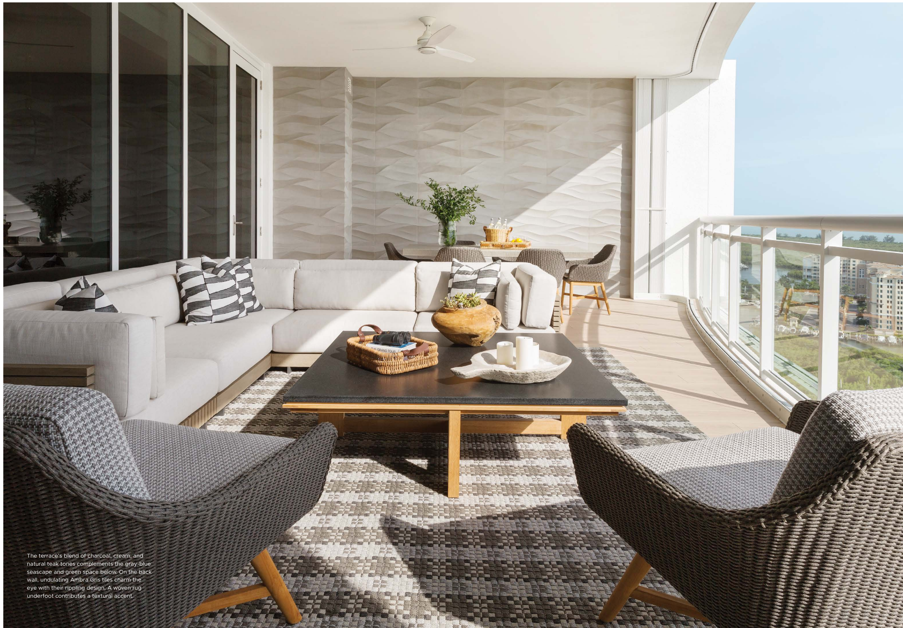
The terrace's blend of charcoal, cream, and natural teak tones complements the gray-blue seascape and green space below. On the back wall, undulating Ambra Gris tiles charm the eye with their rippling design. A woven rug underfoot contributes a textural accent.