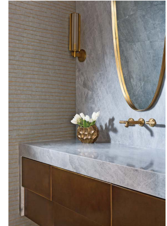
LEFT: The powder room's sleek allure comes from Blue De Savoie marble slabs cladding the floating vanity surface and the back wall. On the adjacent wall, a handmade gold-leaf crinkle-paper wallcovering imparts both sheen and texture.

For a creative transition from the foyer to the living area, the design crew incorporated a wood wrap to bring a notable design feature to the TV wall and balance out the primary suite's double entry doors. The built-in TV was framed with black-stained and natural-stained oak, while the console table was covered in cream leather to create contrast. "It was the perfect answer for color and texture," notes the