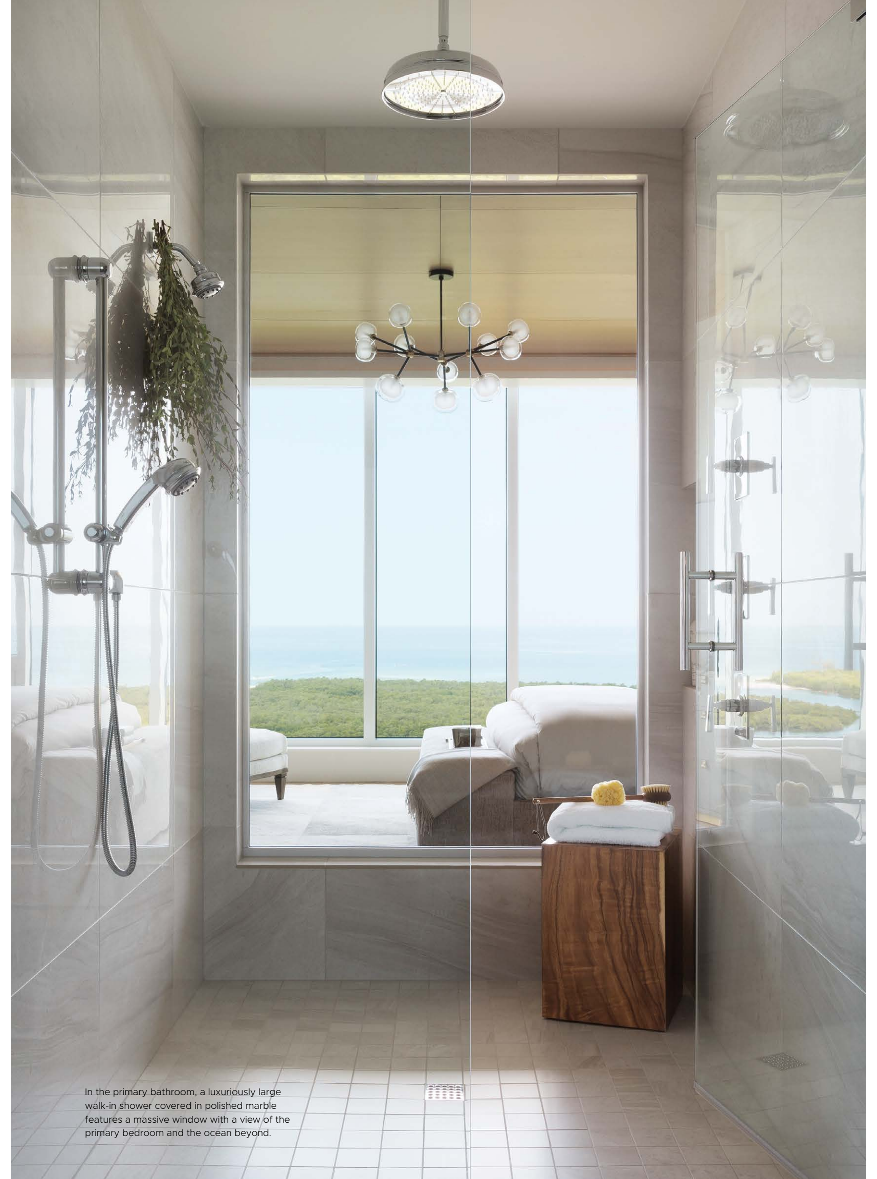
In the primary bathroom, a luxuriously large walk-in shower covered in polished marble features a massive window with a view of the primary bedroom and the ocean beyond.

"I loved that these clients allowed us to be creative with custom details that define separate spaces all within one huge space," says Berry. "They were blown away with the end result and couldn't believe the outcome."